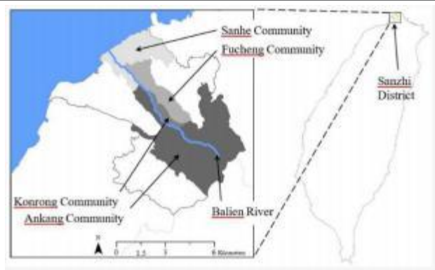
Figure 2: Map of the research area.

This case focuses on four rural communities along the Balien River basin of New Taipei City. We conduct fieldwork in the research area as well as interviews with governmental agencies, community leaders, and residents to explore whether river conservation actions based on community self-governance have stimulated the social production of rural regimes. We also analyze whether the application of SNS media has strengthened the governing capacity of rural collaborative networks. As shown in Figure 3, the research area is in Sanzhi District in the northern New Taipei City, Taiwan. New Taipei City is currently a special municipality; its predecessor before 2010 was Taipei County. Unlike in Taipei City, the capital of Taiwan, administrative resources at the county level were deficient. Moreover, New Taipei City has an extremely large jurisdiction. Sanzhi District is in a peripheral area with sharp urban-rural disparity. According to official information obtained from the Sanzhi District Office, agriculture is still the paramount local economic base. Although many factories were built in the 1980s, the manufacturing sector has declined owing to industrial outflows since the 2000s. Most of the non-agricultural population includes commuters working in Taipei City. Therefore, the research area is geographically characterized as 'rural' although it is jurisdictionally labelled as apart of an urban area.