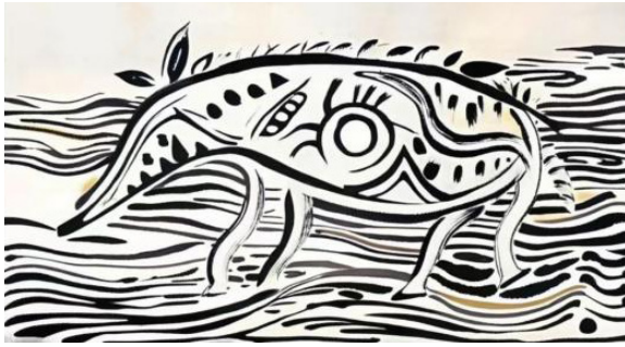
Figure 3. AIGC generated pig stripes.