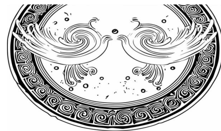
Figure 2. Double bird sunrise pattern generated by AIGC.

transformation of traditional Hemudu ornaments. high-resolution files of Hemudu ornament designs were input into the Midjourney model, accompanied by descriptive keywords such as "minimalist," "atmospheric," and "black and white" to align the generated designs with contemporary aesthetic preferences. Additionally, the prompt "apply the generated pattern to silk scarves" was incorporated to explore potential applications in textile design. By further refining the input to "apply the generated pattern to a silk scarf" the model was able to generate direct previews of lifestyle products featuring Hemudu motifs, including thermos cups, silk scto "apply the generated pattern to silk scarf," arves, and other consumer goods [32-34]. The following are some of the initial results obtained from this process, as shown in Figure 2 and Figure 3.