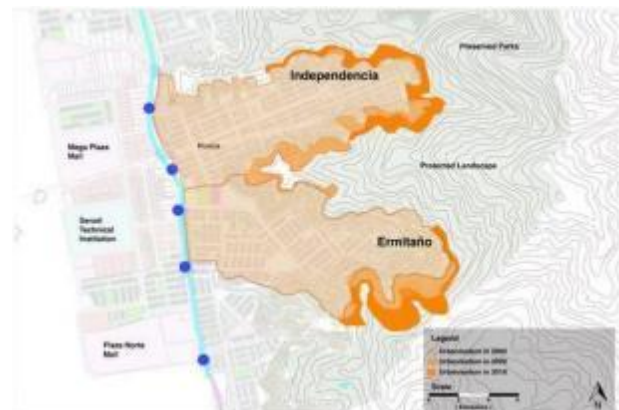
Figure 2: Urban expansion of El Ermitaño and Pampa de Cueva in 2000, 2009, and 2018.