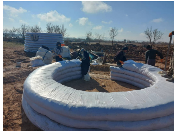
Figure 3. Execution of foundation and wall of Super Adobe shelter in Sanjab, Herat.