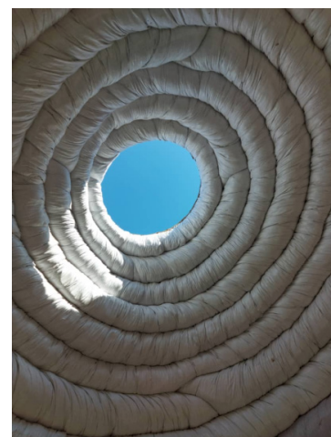
Figure 4. Exterior and interior of the Super Adobe shelter in Sanjab, Herat.