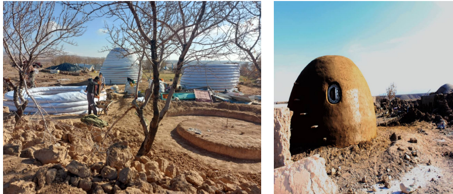
Figure 5. Construction processes of Super Adobe shelter in Sanjab, Herat.

Certainly, construction projects, including Super Adobe construction, can face various challenges that require effective solutions. Here are some of the challenges and possible solutions that arose when trying to build a temporary shelter in Sanjab (Table 5).